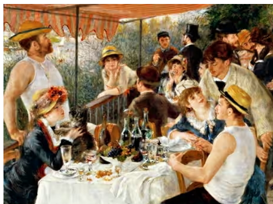
Pierre-August Renoir, 'Luncheon of the Boating Party' (1881)

Coming to Terms with Failure: Gender Relations and the Economy in the Victorian Novel